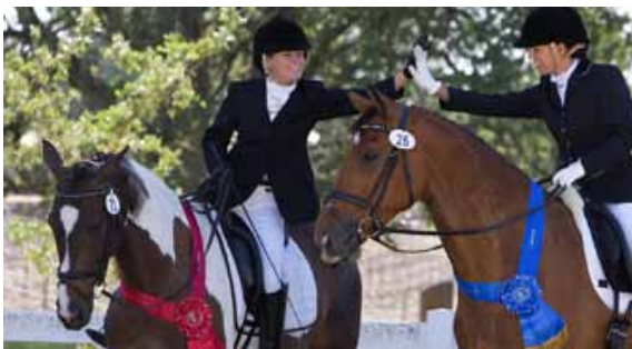
RAAC. Regional Adult Amateur Competitions for Amateurs to compete in Novice or Elite Divisions within their Region, North, Central and South.

Dressage (training or schooling) is an equitation term that means the gradual harmonious development of the horse's physical and mental condition with the aim to achieve the improvement of his natural gaits and perfect understanding with his rider.